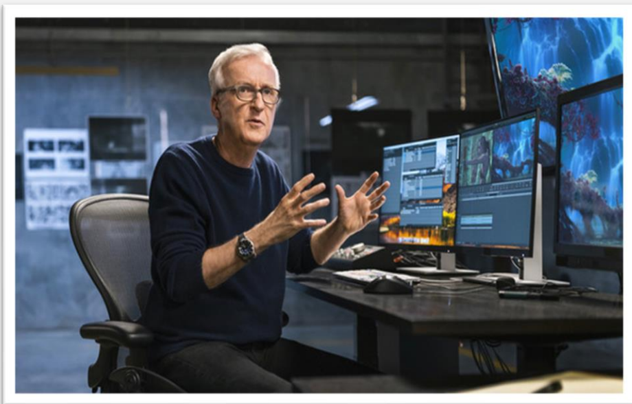
“Your imagination can create a reality”. James Cameron

James Cameron, Barack Obama, Jeffery Bezos, Oprah Winfrey, they all have a story to tell and (live) lessons to share.